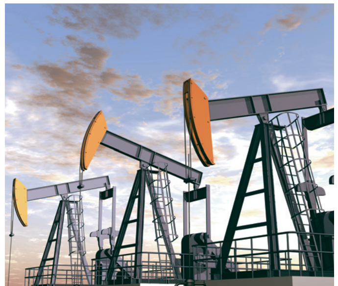
Maintain Production: EnovaFlow for Disposal Well Remediation keeps disposal wells open and production flowing.